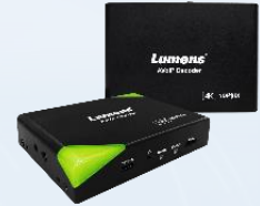
AV over IP