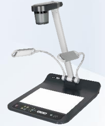
PS753 4K Desktop Document Camera