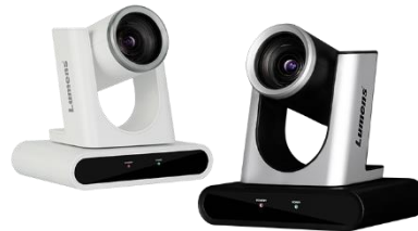
VC-R30 Full HD IP&USB PTZ Camera