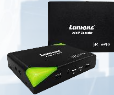
AV over IP