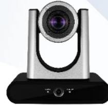
VC-TR40 AI Auto-Tracking Camera