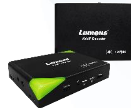
OIP-N40E / OIP-N60D NDI|HX3 Encoder & Decoder