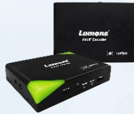
AV over IP

1080P60 / 20X / 3G-SDI, HDMI, NDI | HX, USB