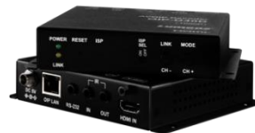
OIP-D40E / OIP-D40D 1G Encoder & Decoder