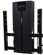
VHD (Very Heavy Duty)