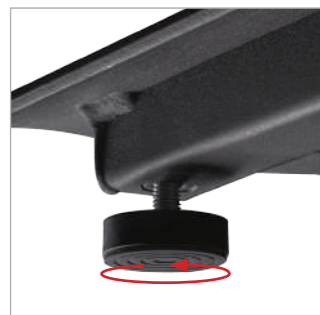
Supplied with adjustable levelling feet to accommodate uneven floor surfaces