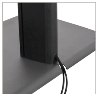
Integrated cable management for a neat and tidy installation