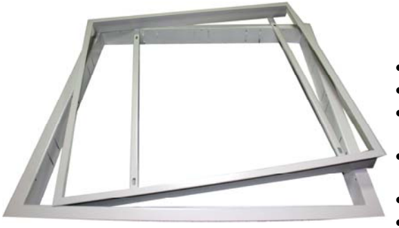
REF: VL-FRAME02 FINISHED KIT FOR VL-PRO SERIES