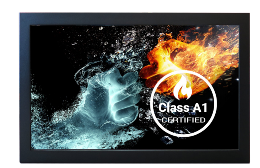
BLO-Line® 24 monitor