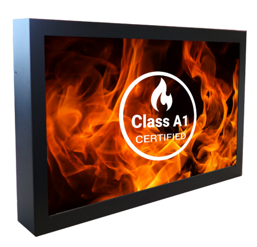
BLO-Line® 24 monitor

All figures are typical values. The real values of the panel may vary. The optical characteristics are determined after the panel has been "ON" for approximately 30 minutes at an ambient temperature of 25^{\circ} C ( 77^{\circ} F).