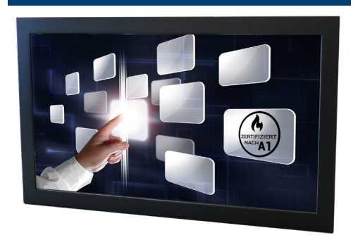
BLO-Line® 24 monitor with touch screen