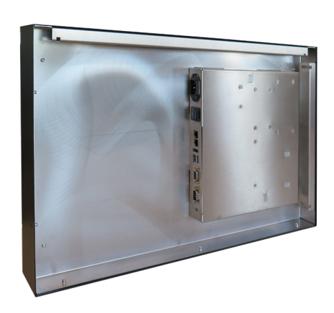
BLO-Line® monitor backside