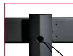
Internal cable management

Unique triangular base design is ideal for fitting in tight locations like a corner or where space is limited