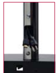
Internal cable management